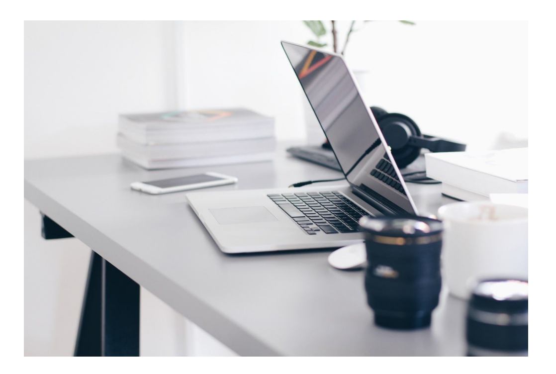
Plyco's Decoply Snow used for an office desk