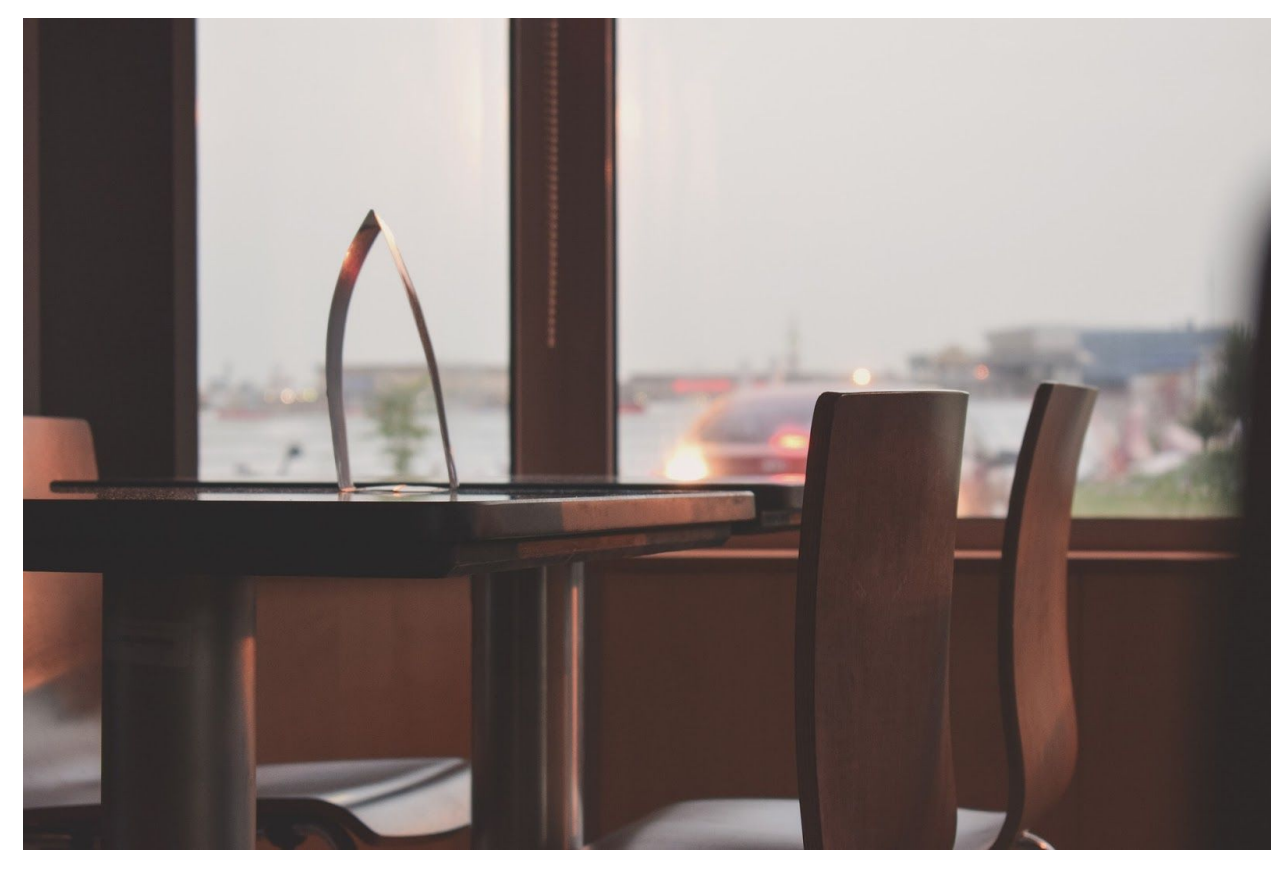
An American Walnut Strataply tabletop

Strataply is a made to order product exclusive to Plyco. Here a selection of decorative veneers are pressed onto a Birch Plywood core, fusing the strength and integrity of Birch Plywood while providing customers with almost infinite appearance possibilities.