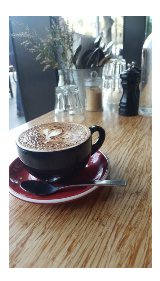
A Bamboo Multi sheet used for a cafe benchtop

Bamboo has become an increasingly popular product, partially due to the fact that it is technically a grass. Bamboo can grow up to one metre per day and does not require replanting after harvesting, which makes it extremely eco-friendly.