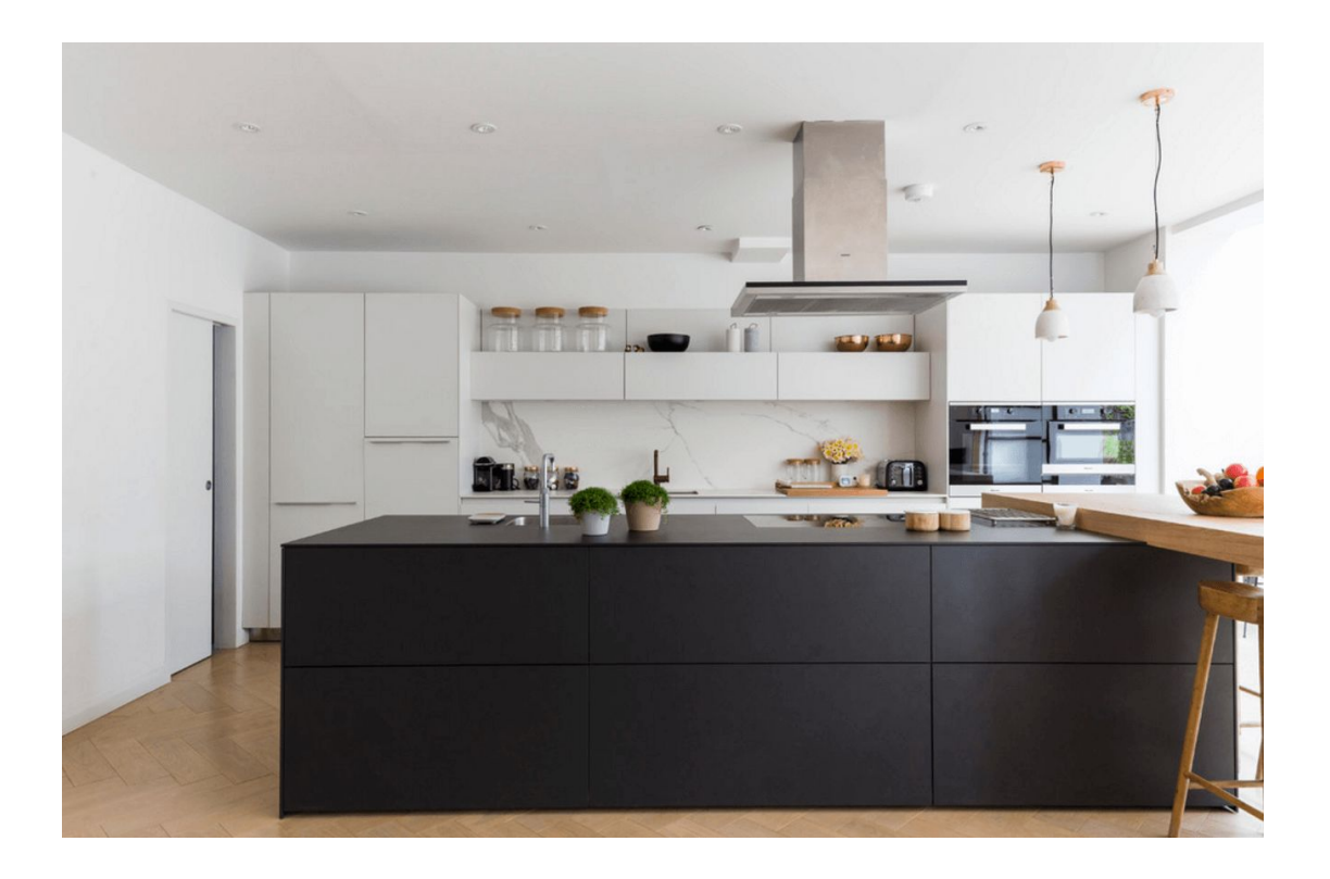
A Spotless Black Laminate kitchen benchtop

Spotless Laminate is a new addition to our ever-expanding collection of laminated panels, bringing a host of new benefits that opens a world of possibilities. The biggest benefit of using the Spotless laminate is its super matte finish. This surface has been scientifically engineered to ensure that no fingerprints are left upon touching it, while also being anti-bacterial, heat and impact-resistant, and able to be left in direct sunlight without fading.